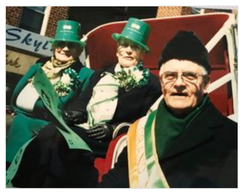
Added by Anonymous