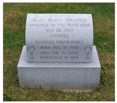
Added by OurPast