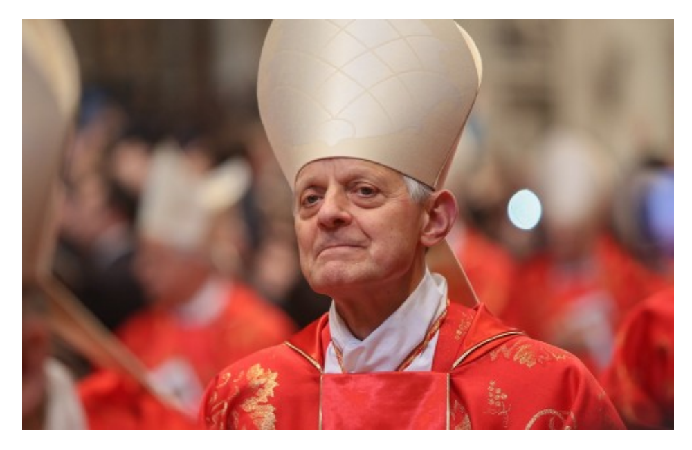
Cardinal Donald Wuerl, an architect of sexual abuse cover-up

Wuerl even nominated himself for sainthood prior to this report coming out, check this out: