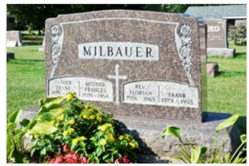
Added by Kitty Check