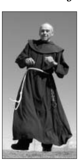
Council News Page 3