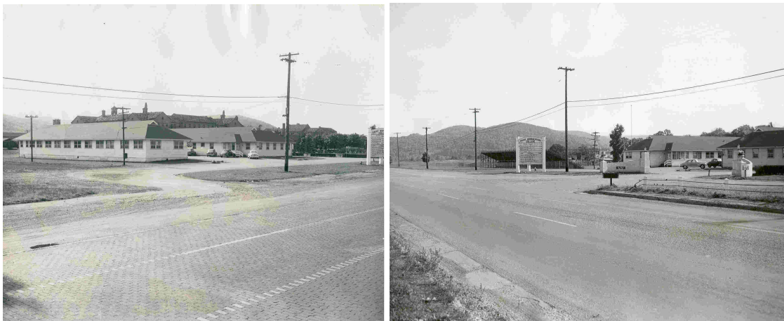
WAVE Barracks (Administration Building at former entrance to the university)

The B.A.W. Construction company of Buffalo, N.Y. was awarded the contract for the building with a low bid of $762,450. The building was built to house all administration offices on campus, as well as the office of the university president, the alumni office and the guidance office. The building was built with the same roof design, with Spanish roofing tile, as the traditional buildings on campus. In the summer of 1972, Hopkins Hall found itself inside the flood plain resulting from Hurricane Agnes.