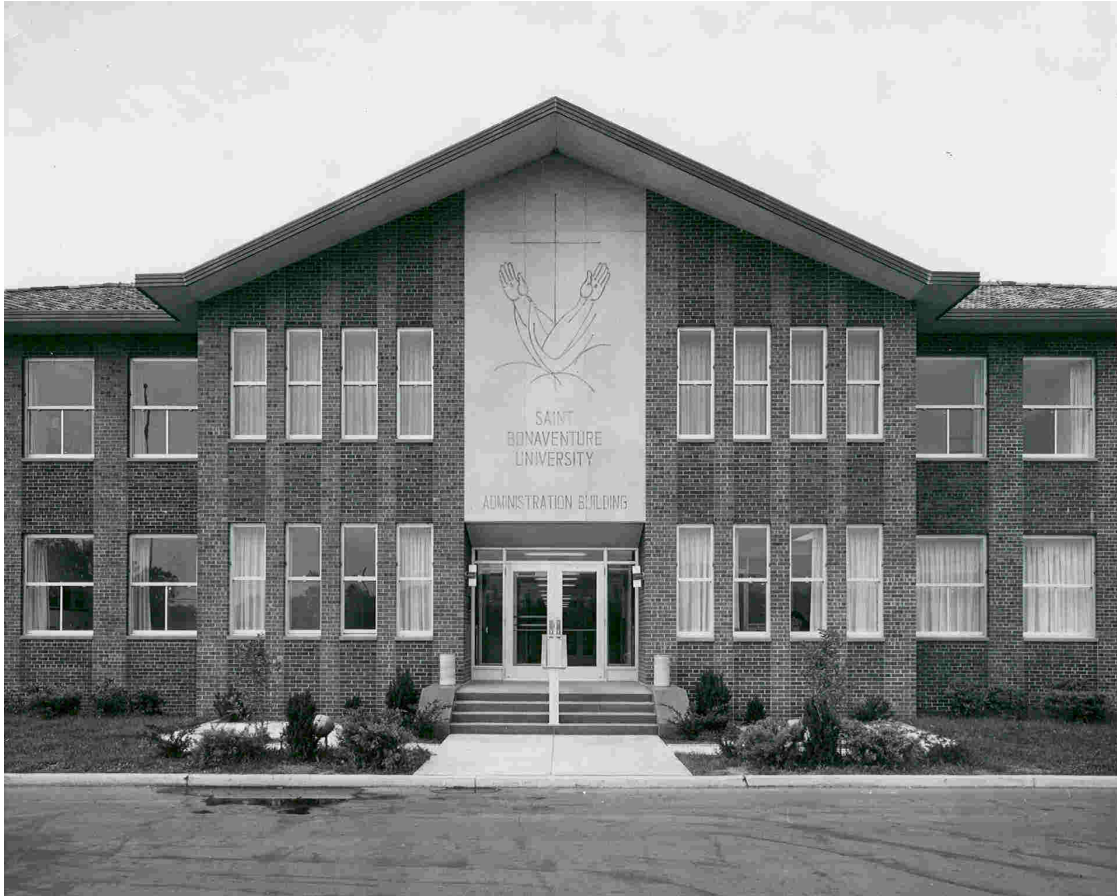
Hopkins Hall (front entrance)