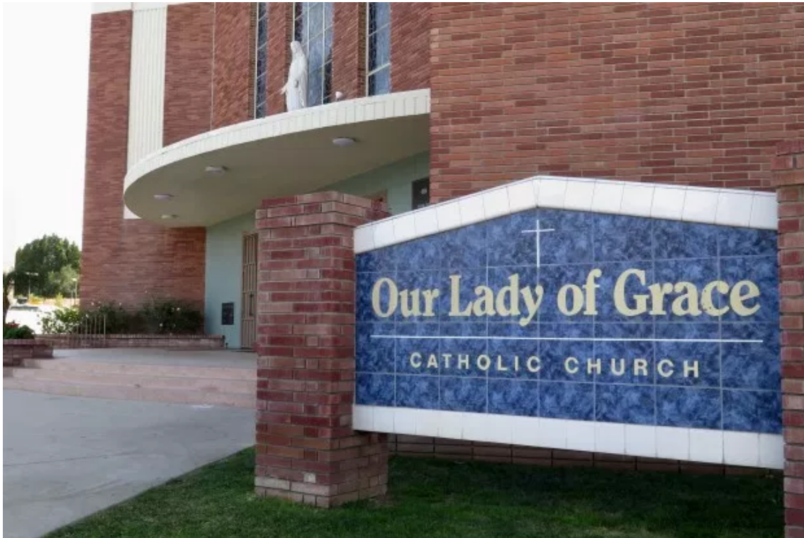
Our Lady of Grace Catholic Church in Encino, photographed Monday, Jan. 29, 2018.